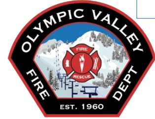
EXHIBIT C 32 Pages