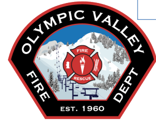
EXHIBIT G-5 3 Pages