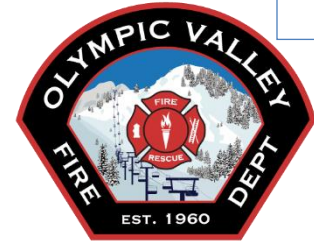
EXHIBIT F-3 5 Pages