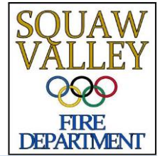
EXHIBIT # D-1 3 Pages