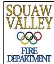
EXHIBIT # D-1 Pages 1-3